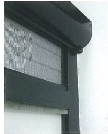
Corner of unit showing, header cassette, adjustment screw, side stiles and moehair

The product has been installed with an oil-decelerator and a gear-decelerator to prevent the handle from hitting the cassette when rewinding. The tension in spring can be easily adjusted by turning the screw attached to cassette.