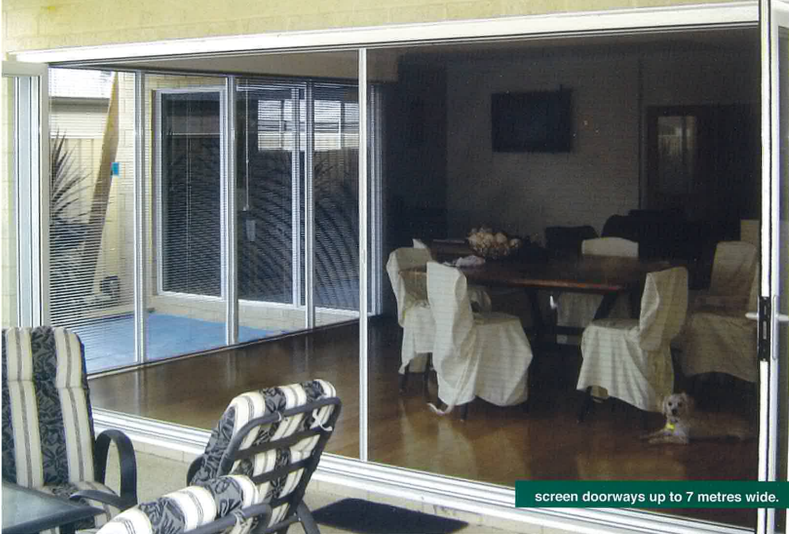
screen doorways up to 7 metres wide.