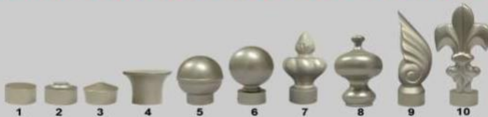
No.1 End Cap, No.2 Button End Cap, No.3 Pyramid Cap, No.4 Flared Finial, No.5 Roman Finial, No.6 60mm Ball Finial, No.7 Crown Finial, No.8 Colonial Finial, No.9 Shell Finial, No.10 Fleur de Lis Finial